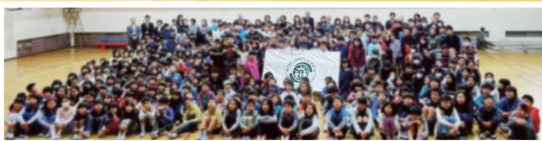
Surrounding the certification flag at the Safety Promotion School certification ceremony

Furthermore, a new system has been established whereby the Safety Promotion School Nomination Committee nominates "SPS Supporters" from among pupils/students at a newly certified Safety Promotion School. Through this system we endeavour to foster the human resources for sustaining the continued development of Safety Promotion School activities at the school. It is hoped that pupil/student-led Safety Promotion School activities will be developed as part of the activities of these pupil/student associations.