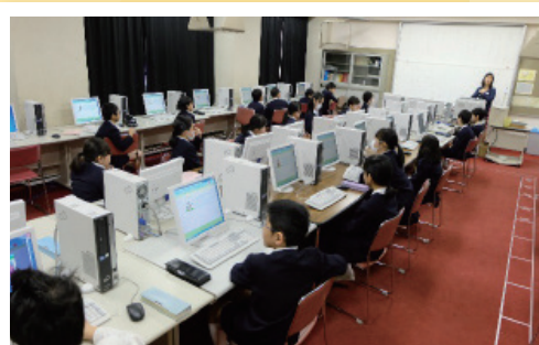
Mutual sharing and communication of activities by certified and supported candidate schools