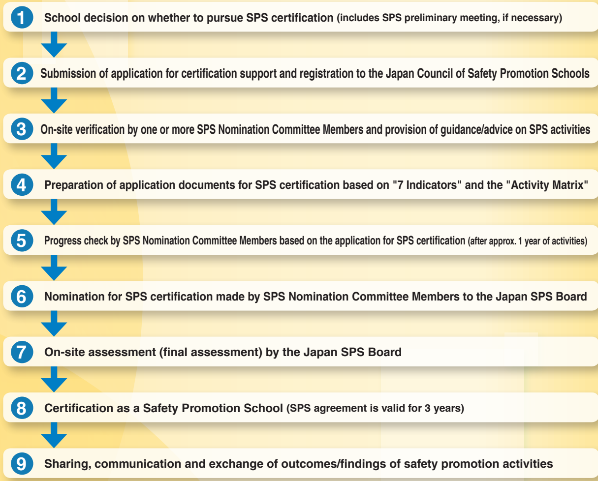
Figure 1: Steps to Safety Promotion School (SPS) Certification